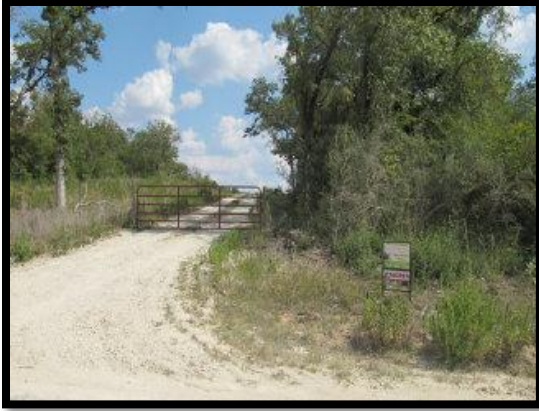
Entrance on CR 482