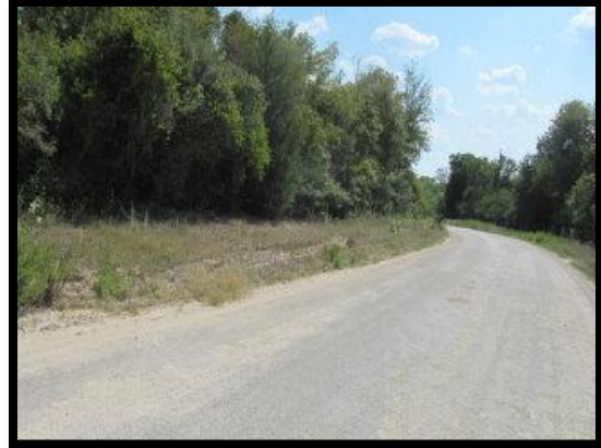
Frontage on CR 482