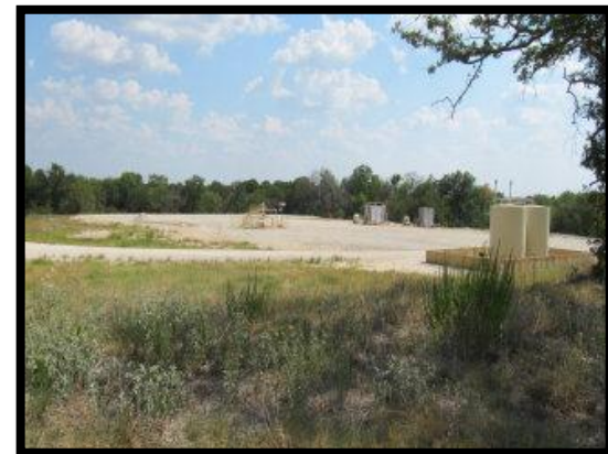
Gas well platform

2010 Total tax assessments were based on a market value of $76,200.00 and were $1,329.56, according to the Leon County Tax Appraisal office in Centerville.