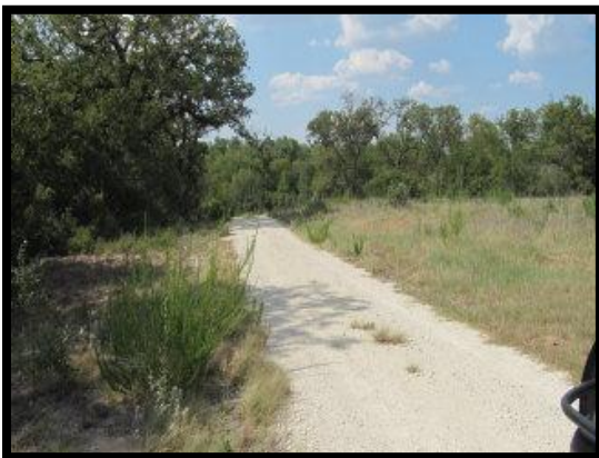
Road inside gate